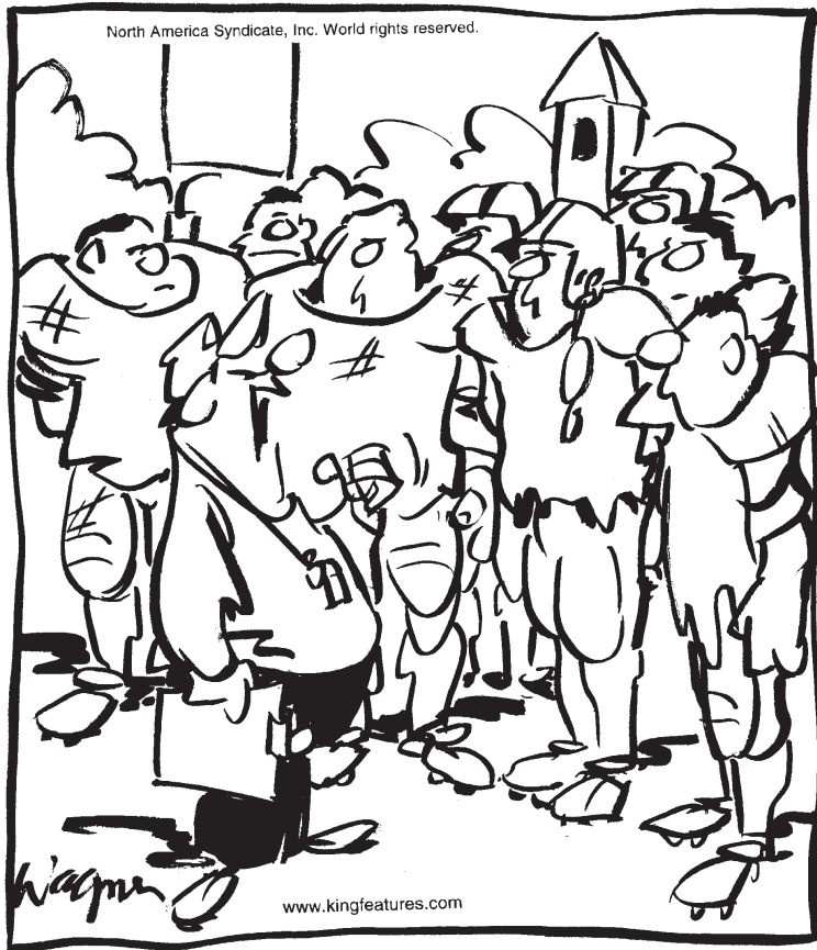
"It's my job to instill some confidence in you losers!"

North America Syndicate, Inc. World rights reserved.