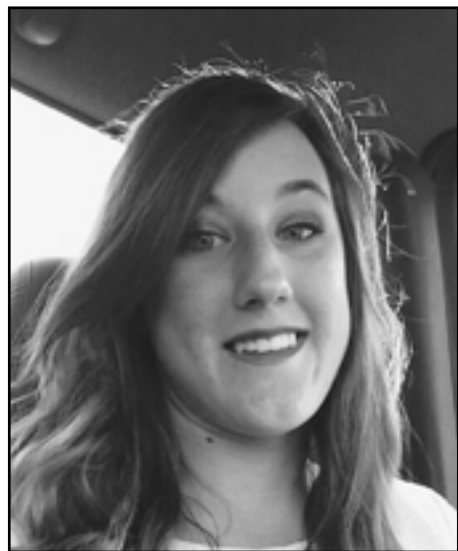
By CAITLIN COODY Columnist

Northwestern recently went through a massive face lift in the athletic department during the "Vision for Victory Campaign".