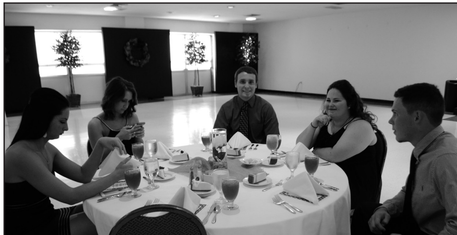
Everyone awaits the Freshman Queen announcement.