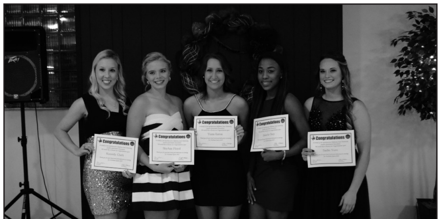
All the Freshman Queen candidates receive their congratulatory certificates.