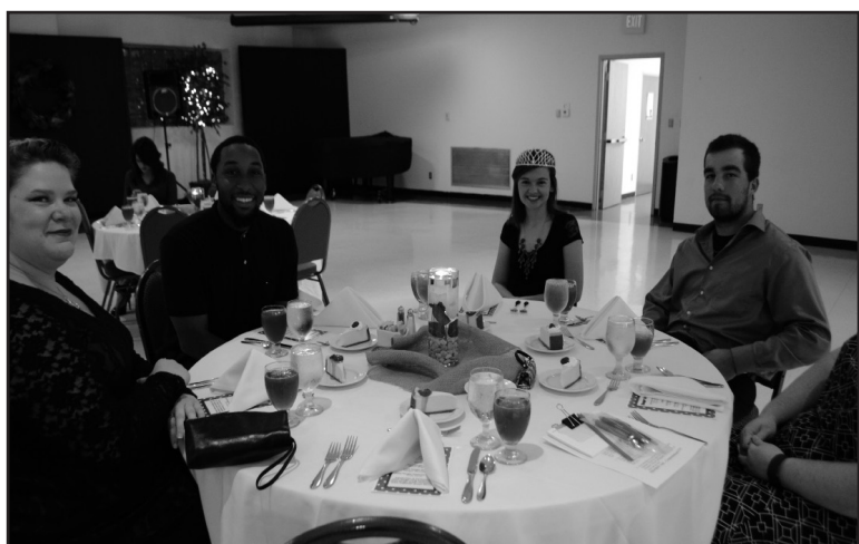
Stuffed porkchop and grilled potatoes were served for everyone in attendance.