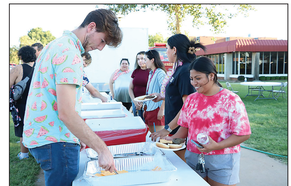
Students, faculty and staff opened Howdy week with meat hot off the grill and all the fixings.