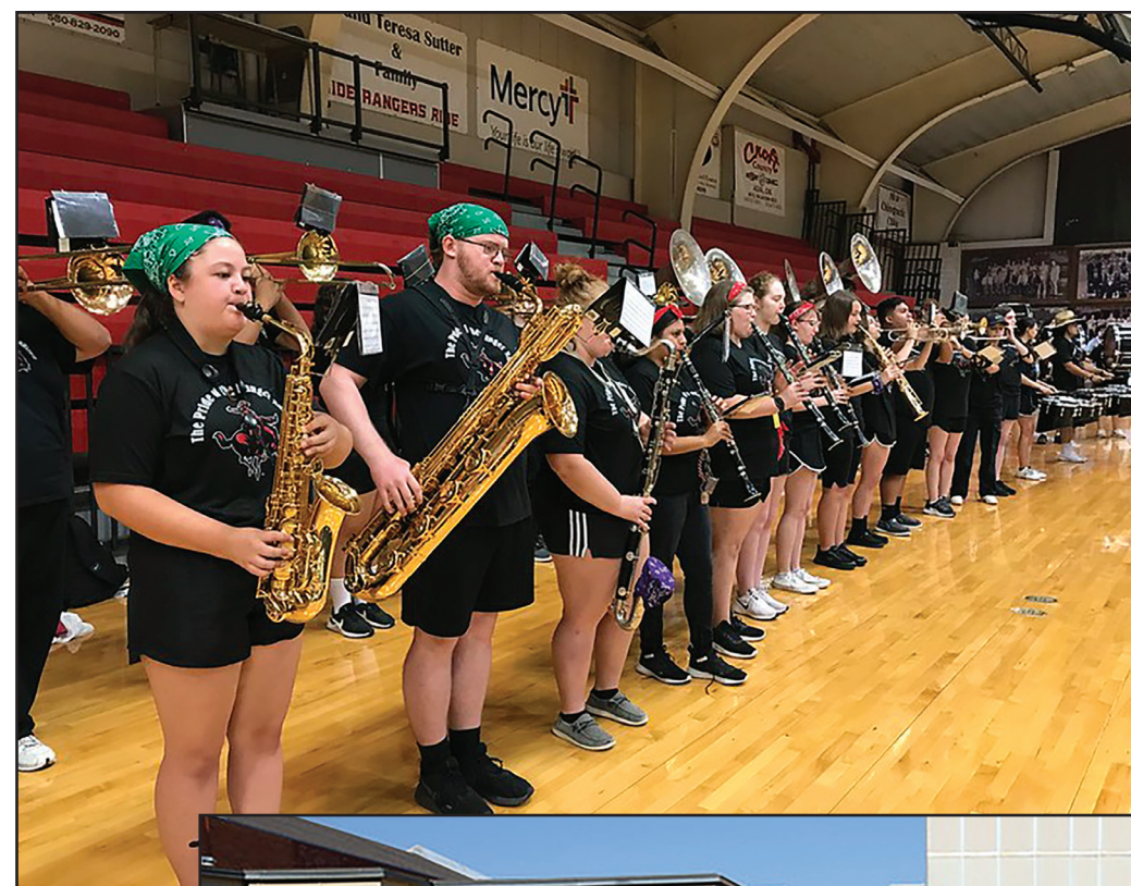
At left, the NWOSU band performs in Percerfull Fieldhouse as part of Freshman Orientation. Afterward, below, student volunteers lead tours around campus.