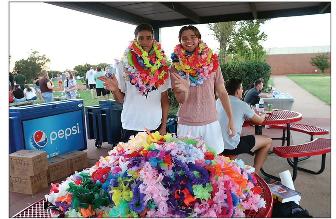
Students collected leis on the first day of Howdy Week, the annual welcome back to campus event.