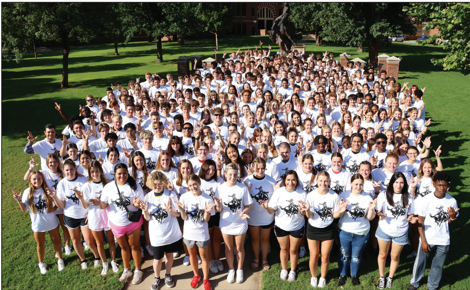
2023 NWOSU Freshman class gathers together at the Ranger statue for the annual picture during Freshman Orientation on August 12th.