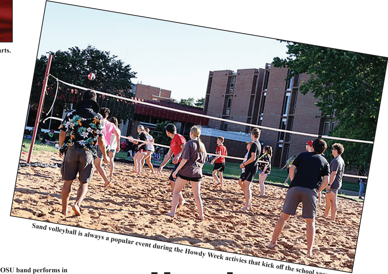
Sand volleyball is always a popular event during the Howdy Week activities that kick off the school year.