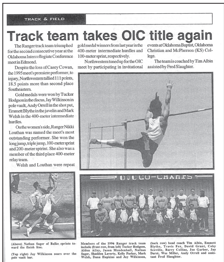
1996 NWOSU track team won at the Oklahoma Intercollegiate Conference.