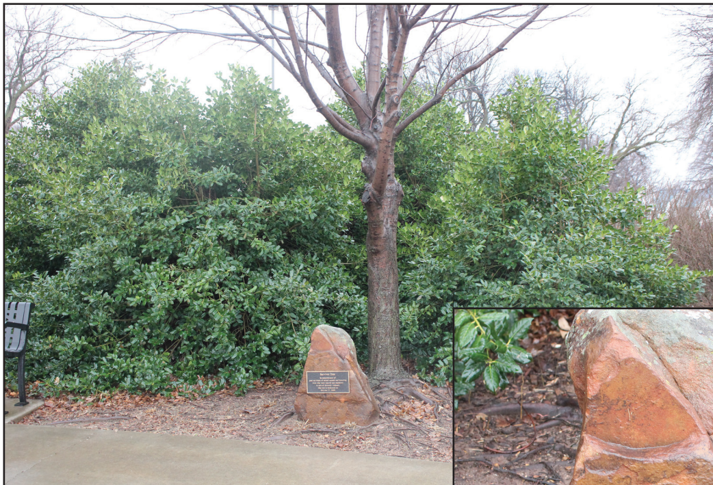
Top, a view of the survivor tree.

Right, memorial of the survivor tree in remembrance of past sexual assault survivors and honoring lives of domestic violence.