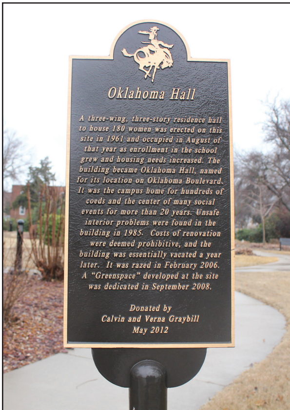
A scenic overview of the greenspace.

There is a spot in front of the NWOSU campus that many students may not be aware of. It has various memorials as well as scenery and seating areas. This would be a great place to bring friends to study, read a book or maybe have a picnic.